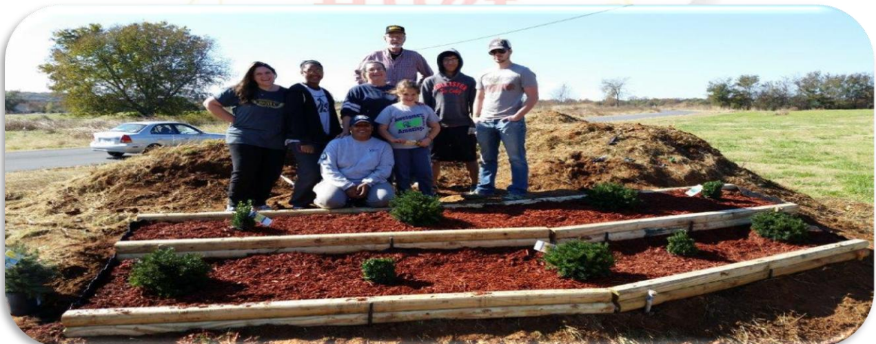
Phase 1 of the project completed. November 8, 2014

In addition to the Arbor Day project, our staff came together in November for another beautification project. This time focusing on the entrance of the addition. With the first phase completed we are now focusing on producing welcoming signage and will complete this project in early spring.