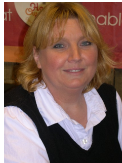
Melissa Shelly Homeownership Center