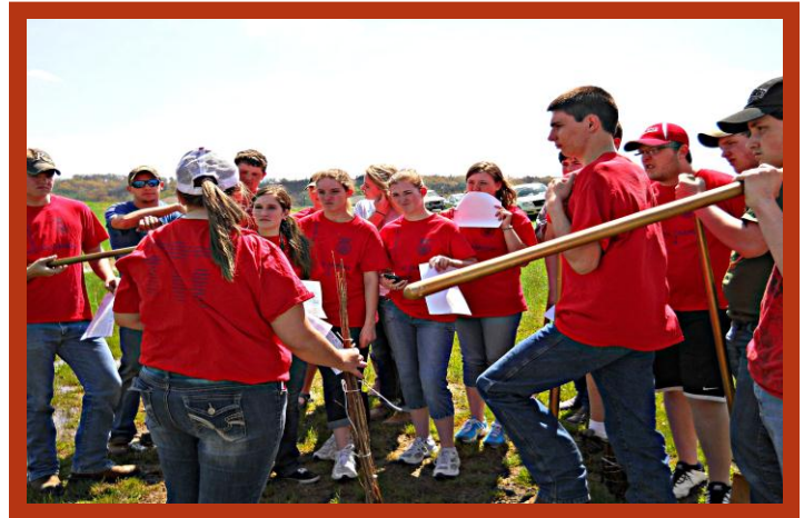
Arbor Day celebrations brought 42 volunteers together in the community of Bluebird a new up and coming subdivision in Cedarville, AR

This program has touched the lives of 54 clients for the month of August. This number has dropped due to the lack of dentists. They are working very hard to get funding to pay for a full-time dentist. If you are needing information please go to our website at www.cscdcca.org and download this application.